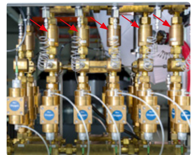
Example of use: